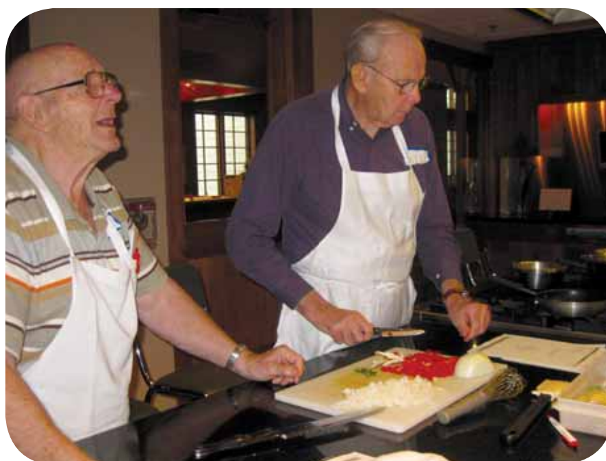
Participants at one of the Eat Smart classes

Cooking and sampling health-smart recipes were main activities at the series of Eat Smart classes held this fall at the New York Wine and Culinary Center. MVP developed the classes in partnership with the New York Wine and Culinary Center.