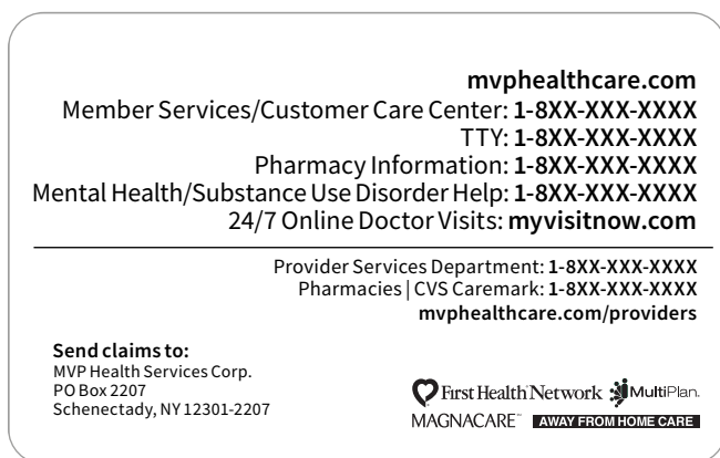
Sample ID Card Back